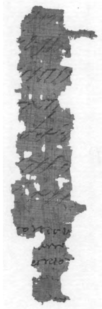
No. 3: P.Vindob. L 145 recto