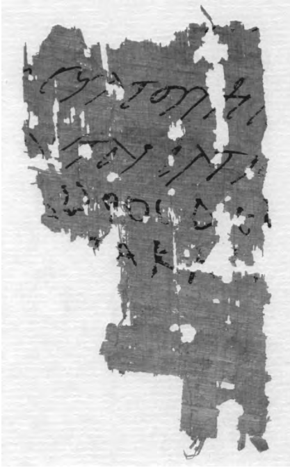
No. 1: P.Vindob. L 70 recto