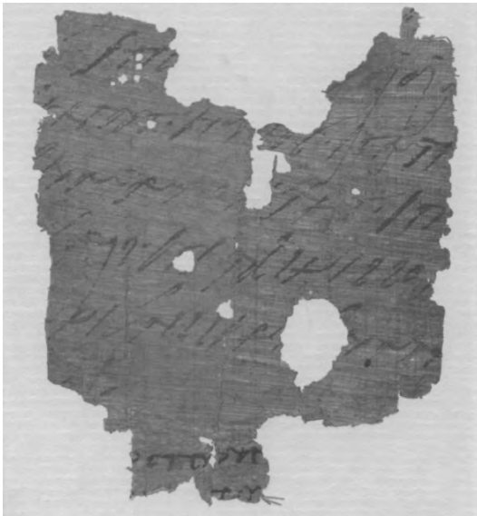
No. 3: P.Vindob. L 77 recto